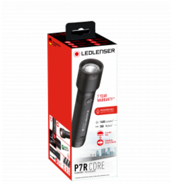
Exemplary Packaging Illustration